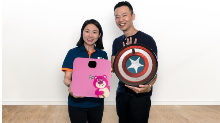
Caption: Developed out of a long-term strategic partnership between HKBN and MOMAX, Smart D offers a diverse range of stylish and easy-to-use smart products.