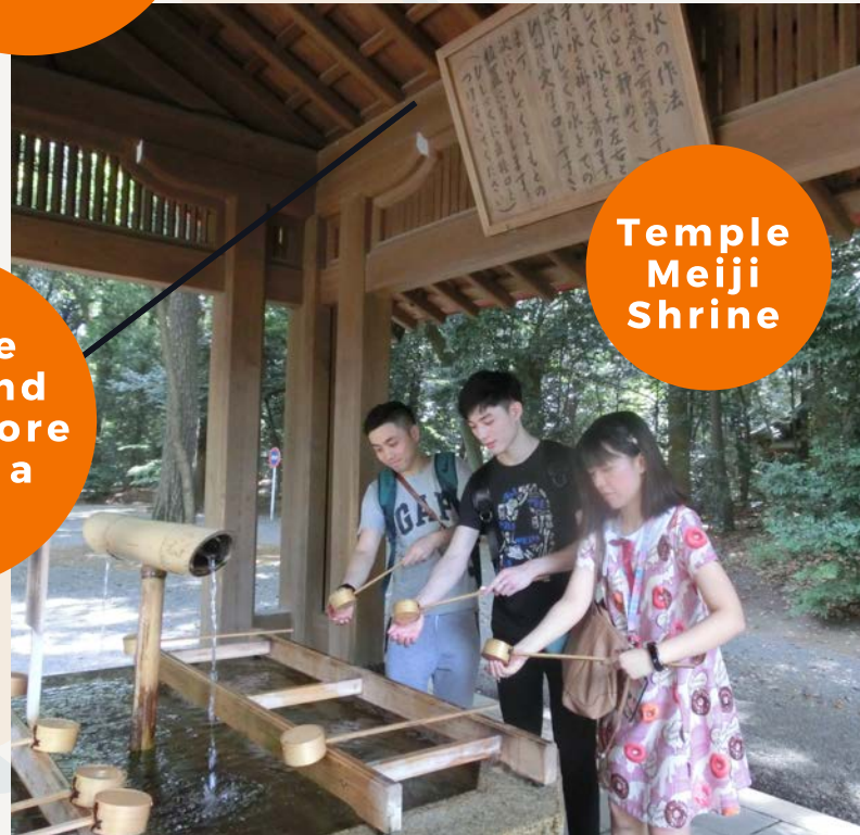
Temple Meiji Shrine