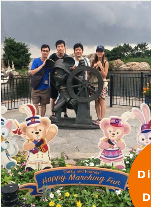
Disneyland & DisneySea