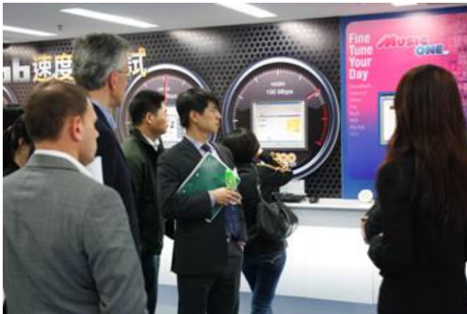
Picture 14 : Visit to our Customer Service Centre, at the heart of Hong Kong's shopping district Mongkok