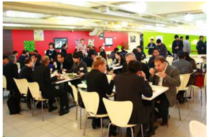
Picture 9 : Non Michelin rated US$3/Pax Gastronomic Made-to-Order Lunch at Talent Canteen, Free Zone