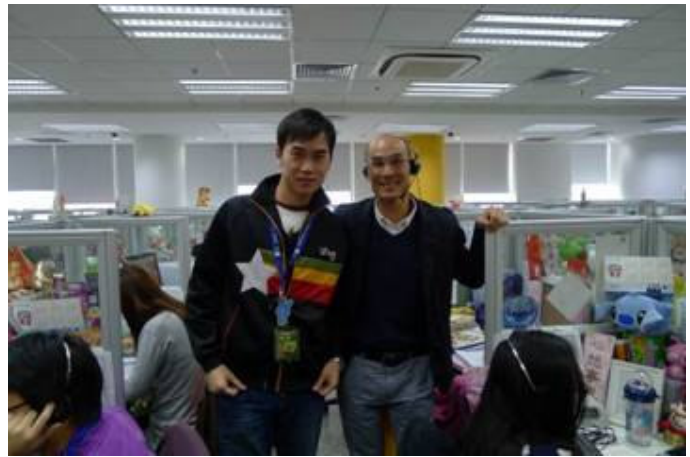
Picture 17, 18 : Guangzhou Visit our Customer Engagement Team, and met our featured talent in “Service With Heart” Customer Engagement Talents