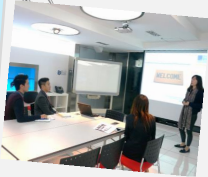
OrienTalent by TOD Tara