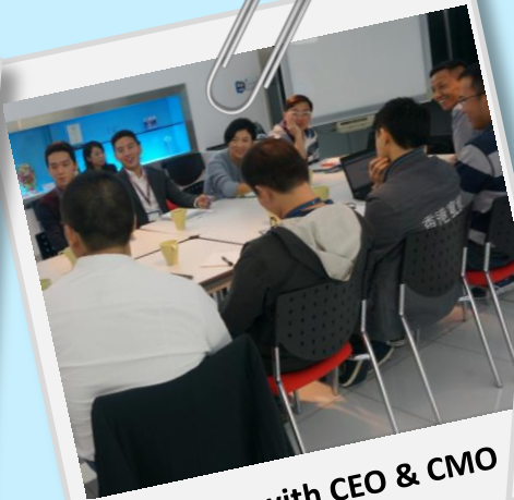
Meeting with CEO & CMO