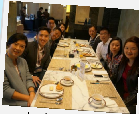
Lunch with Leaders