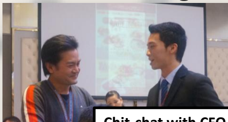
Chit-chat with CFO NiQ